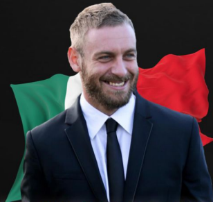
DANIELE DE ROSSI

Manager and former international football player. Raised in the Empoli's academy, he wore Genoa, Sampdoria, Fulham's jerseys and graduated Italian champion with A.S. Roma winning the league in 2001. He began his career as manager in 2011 with A.S. Roma before moving to Catania, Fiorentina, Sampdoria and AC Milan, winning the Italian Supercup in 2016. In 2018 he became the manager of Sevilla and in 2019 he returned to train AC Fiorentina.